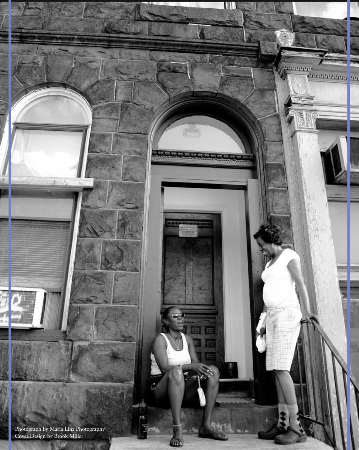
Cover Design by Brook Miller

Mission • Project PLASE, Inc. addresses homelessness in Baltimore by providing transitional housing, permanent housing & supportive services to homeless adults. We serve the most vulnerable & underserved, including persons with mental illness, HIV/AIDS, addiction, developmental disabilities, & ex-offenders, etc. We treat, restore & rehabilitate the whole person. We empower each individual to function at the highest level possible.